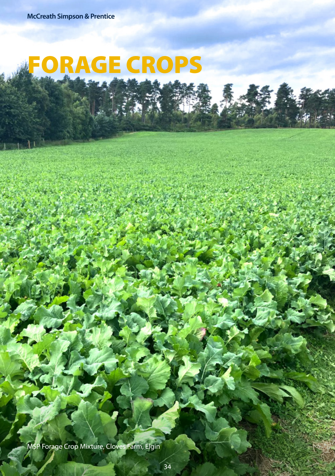
MSP Forage Crop Mixture, Cloves Farm, Elgin

Forage crops continue to play an important role in building resilient and profitable farming systems across the UK.